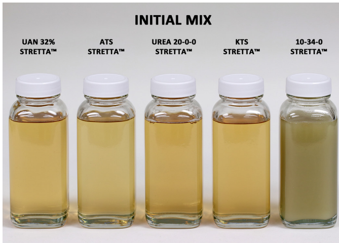
STRETTA adds a darker, amber color, but mixes easily.