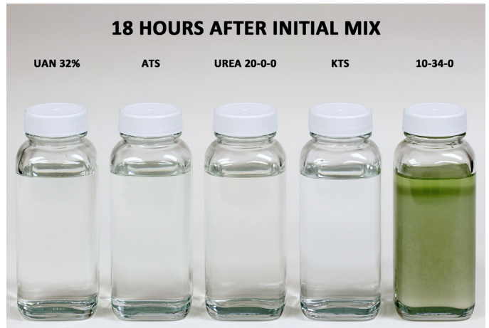
10-34-0 naturally separates even without combining with other products.