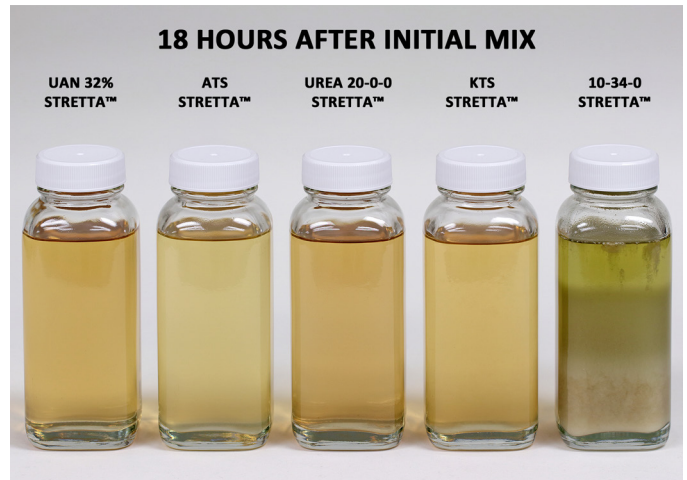
STRETTA stays in solution with common fertilizer products. 10-34-0 requires agitation with or without STRETTA.

Stretta is a trademark of Precision Laboratories, LLC